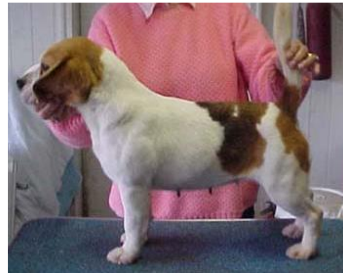
Open marked tri