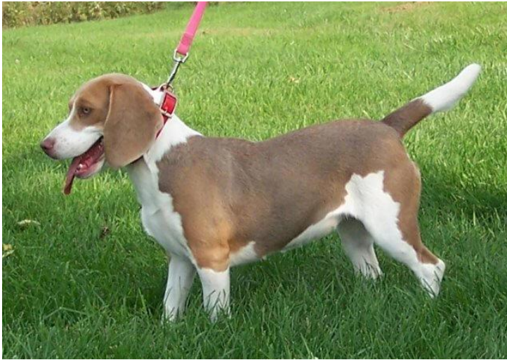
Lilac (Isabella) Tri (Chocolate with Blue factor)