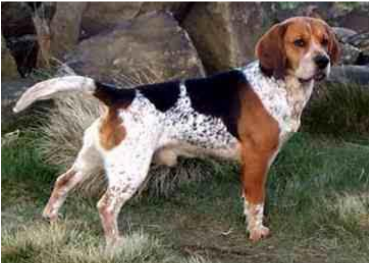
Black/white and tan tri "Ticked" (Mottle)